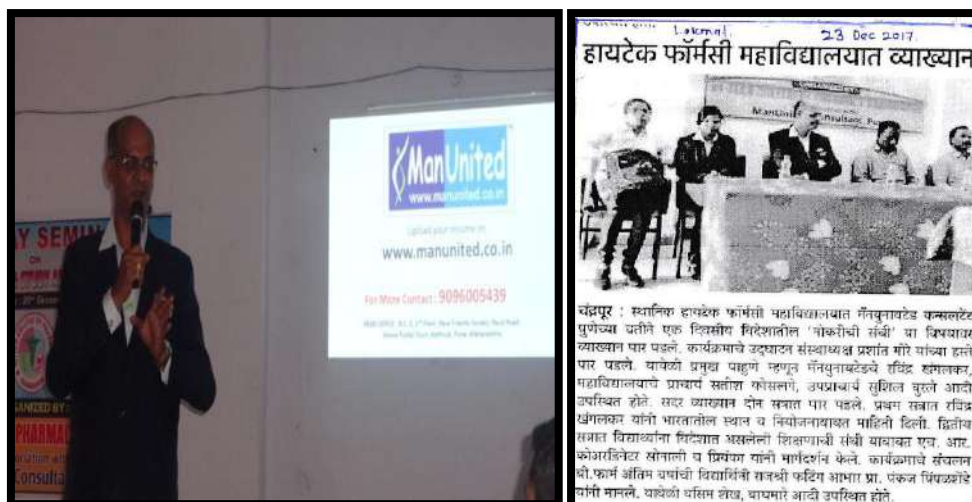
Seminar on Domestic Placement and Study Abroad Opportunities