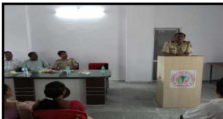
Seminar on Women's and Drug Abuse ment