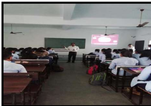
Guest lecture on how to Prepare Competitive Examination

The speaker even shared his thoughts on starting the preparation which incorporates firstly to know the syllabus, weightage of topics and pattern of exam, make and follow a timetable, eliminate all the exam related fear and stress, never try to study anything new in the last few days. All the information shared was beneficial from the student's future perspective. Students of B.Pharm and D.Pharm participated in the program along with teaching staff.