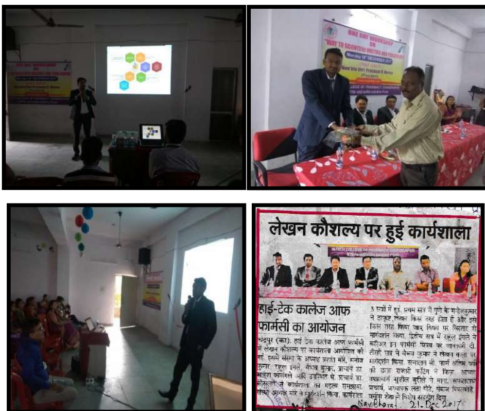
Guest lecture on Way to Scientific Writing and Publishing