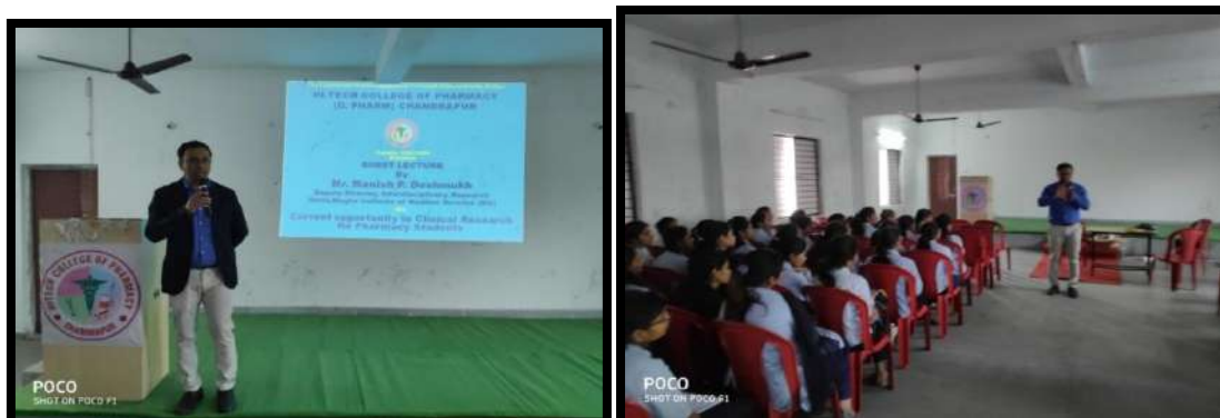
Seminar on Current opportunity in clinical research