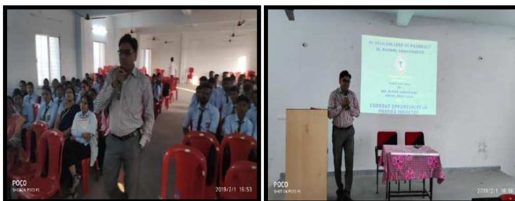
Guest lecture on Current opportunity in pharma industry