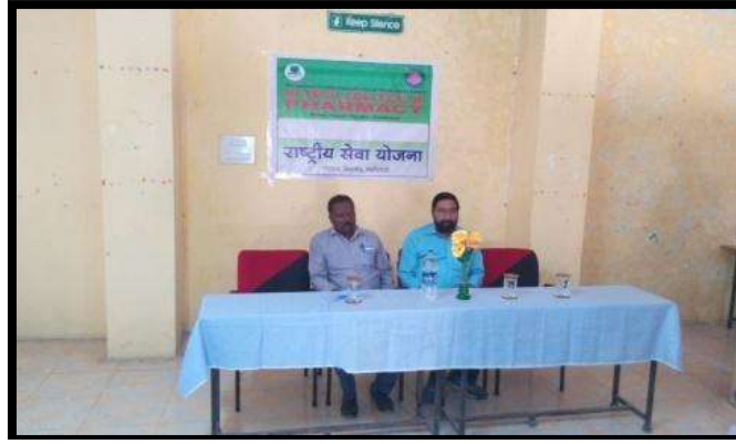
Seminar on resume developmen