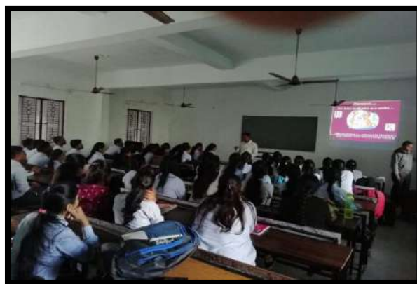
Seminar on Future prospects after pharmacy.