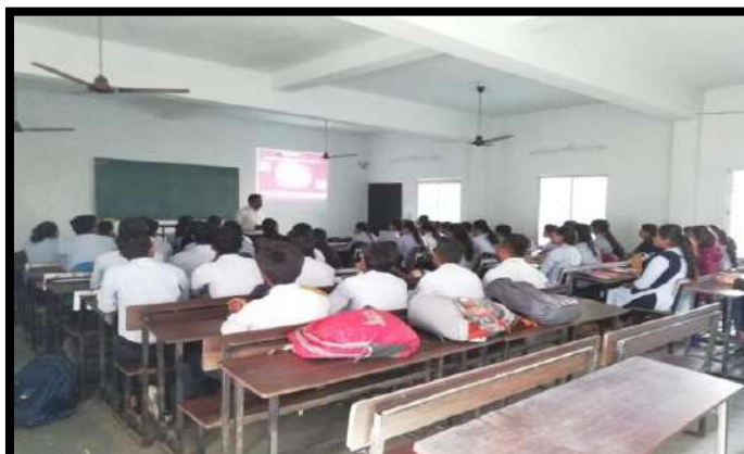
Seminar on Novel Drug Delivery System

The session was very interactive; students were very attentive and asked questions and clarified their doubts. Students of B.Pharm and D.Pharm participated in the program along with teaching staff.