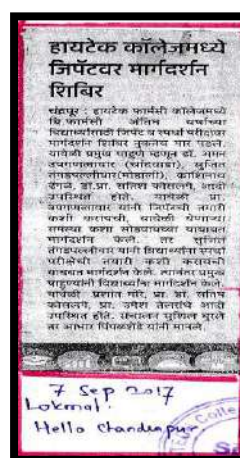
Seminar preparation of GPAT